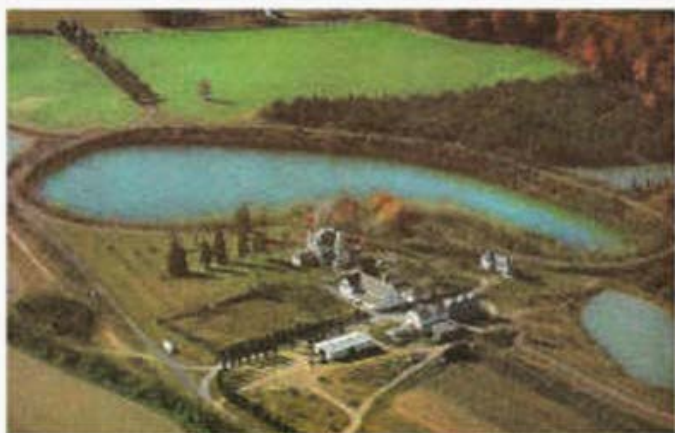
1963 - Inspiration Lake (center), Lake Lynette (upper right), Lake Helene (lower right)