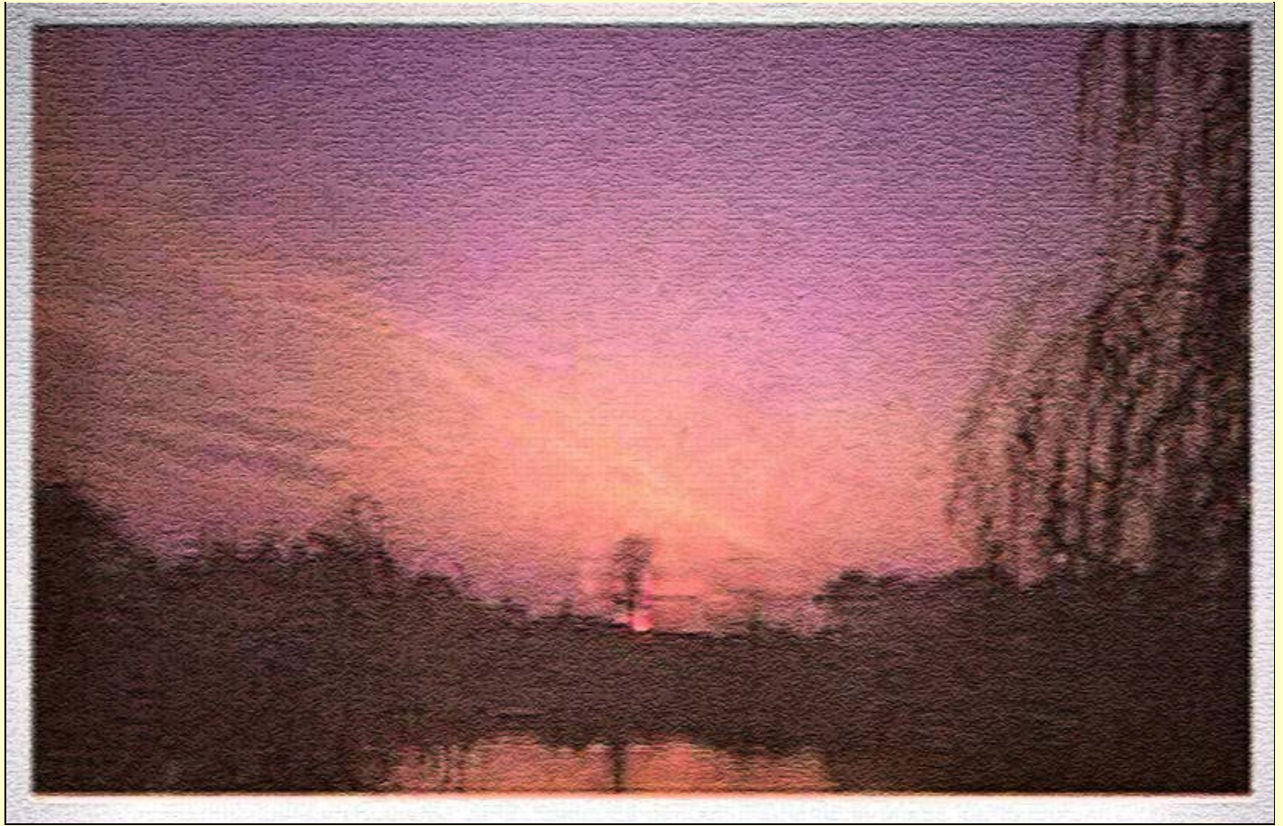
Sunset over Inspiration Lake