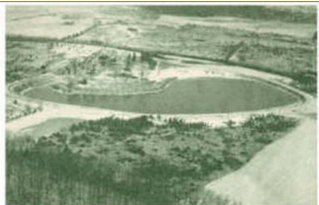
1950 - Inspiration Lake and Lake Lynette Lower left, Under construction (named after Marie O'Donnell's grandmother).