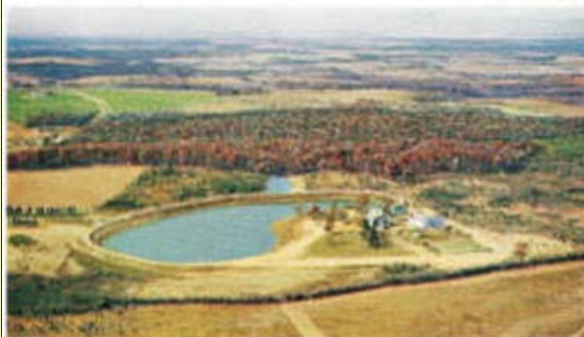
Kodachrome Air View of Inspiration Lake and Lake Lynette Kentland Farm, Maryland [OBK]