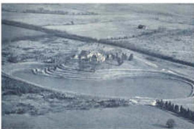
1949 - Building Inspiration Lake