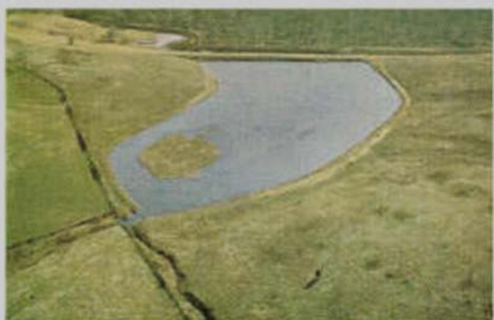
1961 view of Lake Varuna (lake #7) and Sanctuary Island.