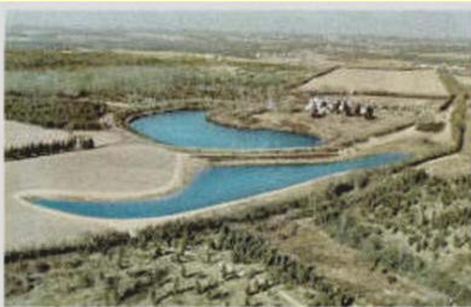
1950 view of Inspiration Lake and Lake Nirvana in foreground.