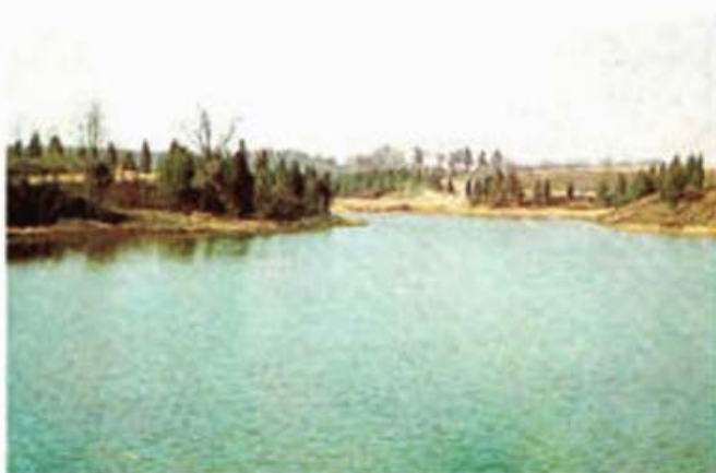
1965 - Lake Vishnu (19 acres: 90,000,000) Largest of 14 lakes on Kentland Farms. Last lake constructed by David Bean.