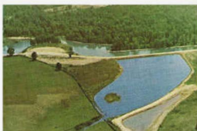
1962 - Lake Varuna in foreground and recently completed Lake Elysium